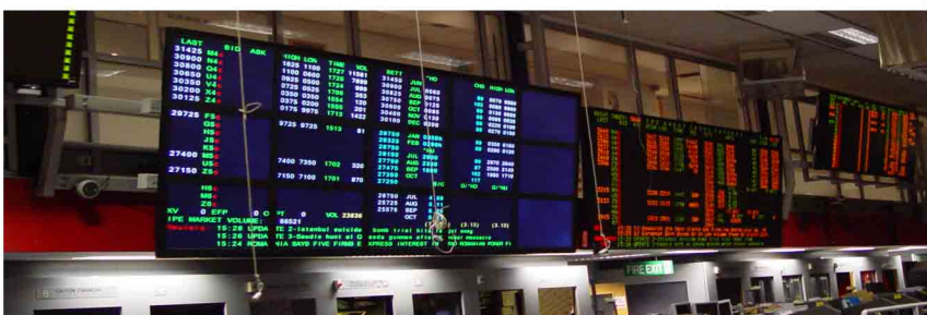
New and old style wall board.

Traders prefer the new wall board to old on the fact that the characters are easier to read and full colour is available.