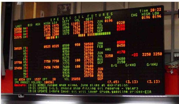
Old Wall board showing line 7 failing.

IPE installed their original wall boards over 8 years ago. Since that time the original manufacture of the wall boards have gone bust twice and taken over three times. Spares to keep the existing wallboards going are now non existent, spares have to be found or made available. The only solution available to IPE was to replace one of the existing wallboards with a new one and cannabalise the old board for spares to keep the other wall boards going. Harp were recommended to IPE as a suitable company that would have an appreciation of different display technologies and have the ability to develop software that could that the existing feed to the wall board and convert into a suitable output for video wall processor's.