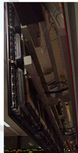
150 mm Deep WallBoard